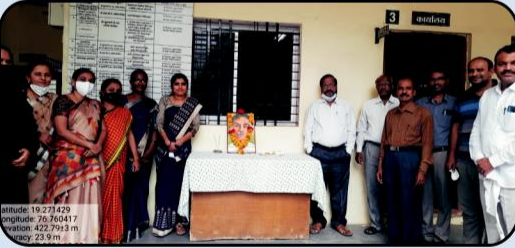
प्रेमचंद जयंती प्रसंगी प्राचार्य व सर्व महाविद्यालयीन स्टाफ