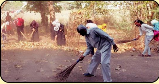
महाविद्यालयाचा परिसर स्वच्छ करताना राष्ट्रीय सेवा योजनेच्या विद्यार्थिनी व कार्यक्रमाधिकारी