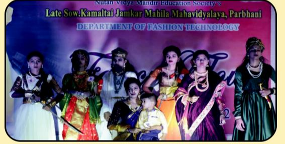
बी.व्होक. (एफ.टी.) विभाग आयोजित फॅशन शो