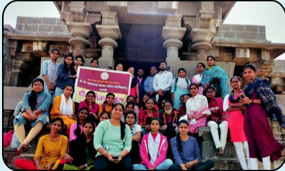
इतिहास विभाग आयोजित शैक्षणिक सहल केदारेश्वर मंदिर, धर्मापुरी