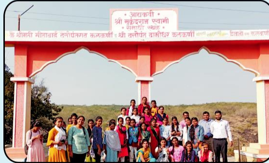
मराठी विभाग आयोजित शैक्षणिक सहल मुकुंदराज स्वामी समाधी स्थळ, अंबेजोगाई