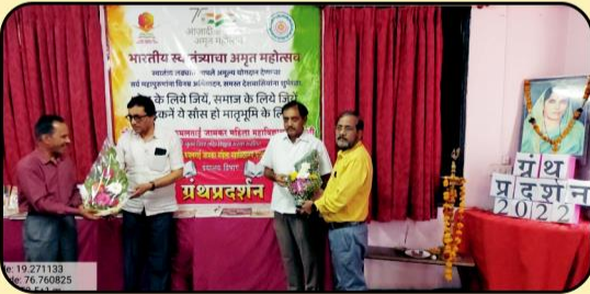
ग्रंथप्रदर्शन प्रसंगी संचालक मान्यवरांचे स्वागत