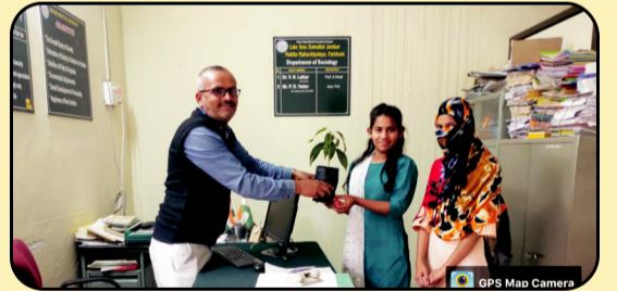
समाजशास्त्र विभाग आयोजित एक विद्यार्थिनी एक वृक्ष दत्तक उपक्रम