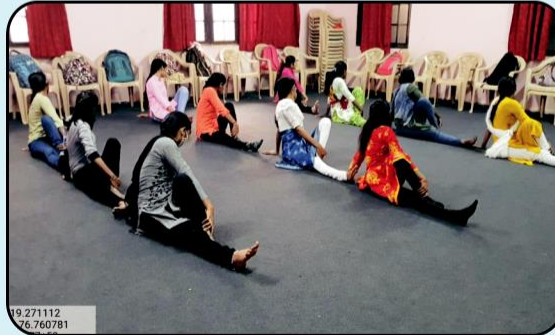
क्रीडा विभागाच्या वतीने आयोजित योग शिबिरात सहभागी महाविद्यालयीन विद्यार्थिनी