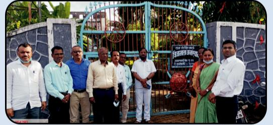
सिंदखेडराजा येथे जिजाऊ यांच्या जन्मस्थळी भेट