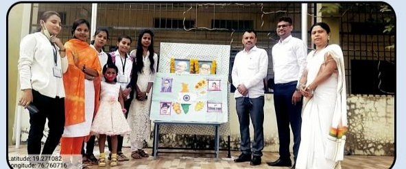
प्रजासत्ताक दिनानिमित्त अर्थशास्त्र विभागाच्या वतीने भितीपत्रकाचे विमोचन