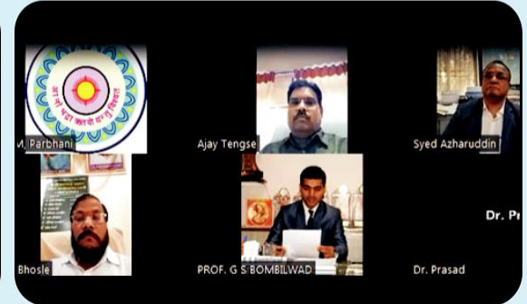
IQAC & Commerce Dept. Research Center आयोजित तीन दिवसीय आंतरराष्ट्रीय आंतरविद्या शाखीय वेबीनार