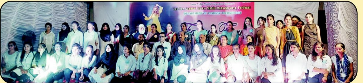
बी.व्होक फॅशन विभागाच्या वतीने आयोजन फॅशन शो मध्ये सहभागी विद्यार्थिनी, मार्गदर्शक प्राध्यापिका, मान्यवर पाहुण्यांसह...