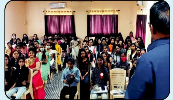
वाणिज्य विभाग आयोजित बी.कॉम. प्रथम वर्ष विद्यार्थिनींचा स्वागत समारंभ