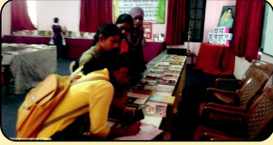
ग्रंथ प्रदर्शनात सहभागी विद्यार्थिनी