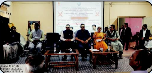
स्त्री अभ्यास केंद्राच्या वतीने आयोजित जिल्हास्तरीय कार्यशाळा