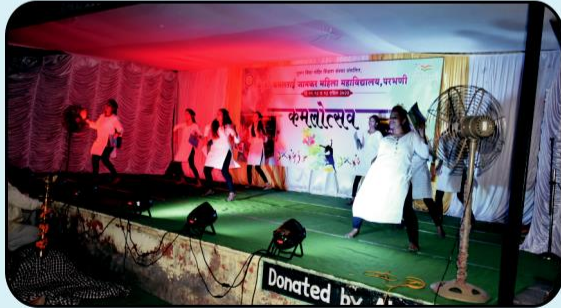
'कमलोत्सव २०२२' प्रसंगी छात्ररजनीमध्ये सादरीकरण करतांना महाविद्यालयीन विद्यार्थिनी